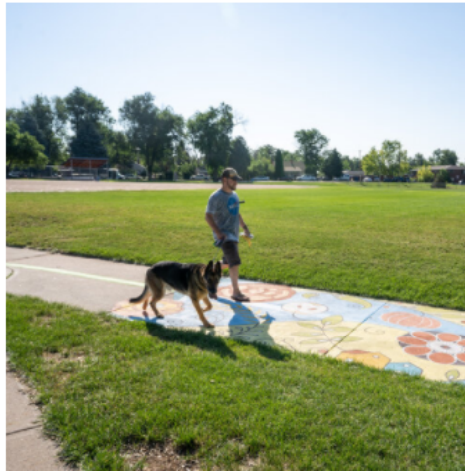
Art and Leisure Tour