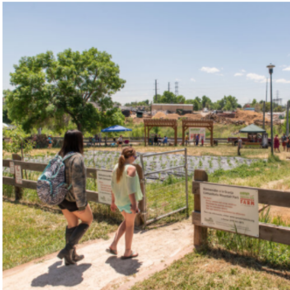
Urban Agriculture Tour