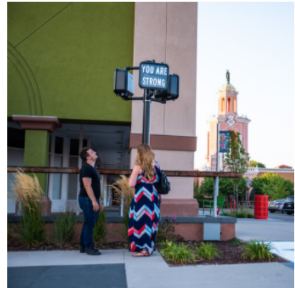
Food, Art and Drinks Tour