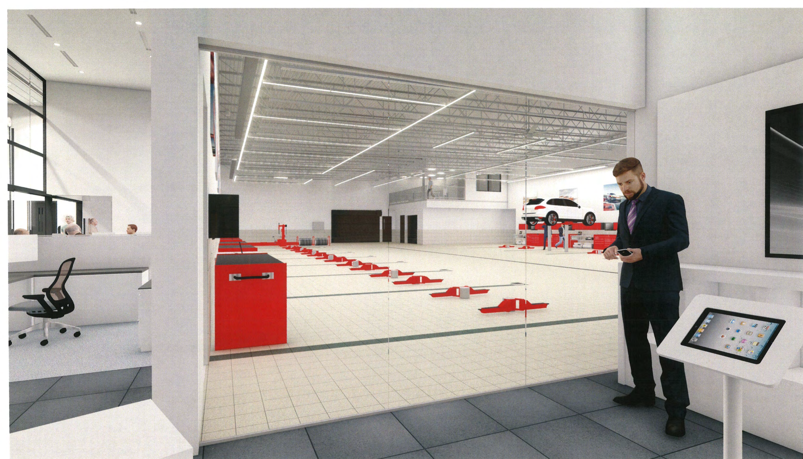
DENVER WEST PORSCHE - MERCHANDISE AREA TOWARD SHOP